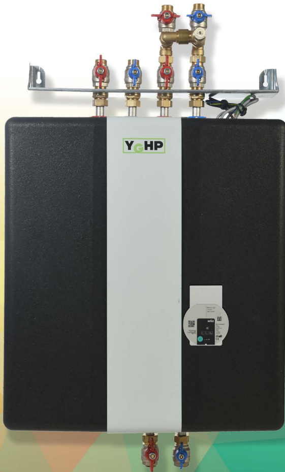
HIU Indirect Series - Cover On